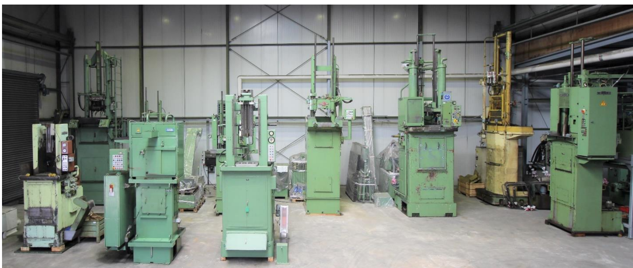
Picture from our used machines stock, with vertical machines up to 63.000 kg tractive force