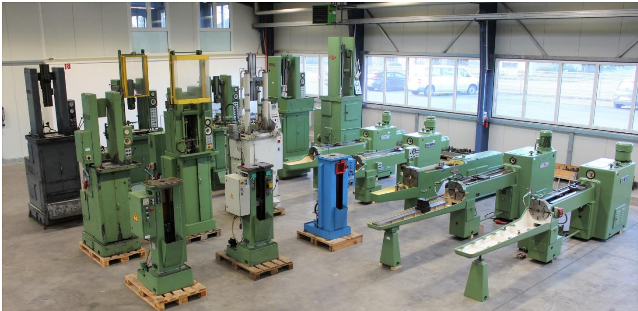
Picture from our used machines stock, with horizontal and vertical machines up to 16.000 kg tractive force

We are a contract broaching company and can also help you with technical questions from 50 years of experience in broaching technology.